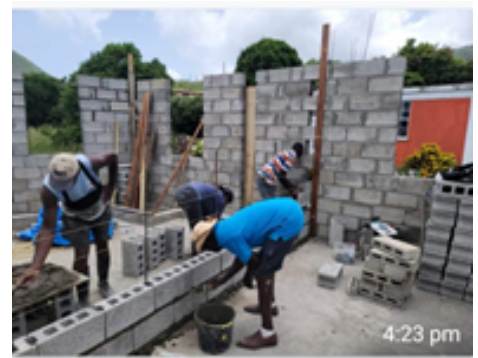
How it went