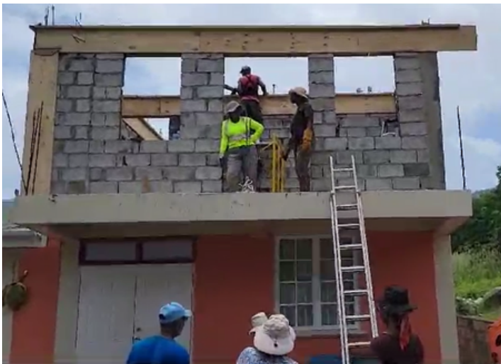
How it ended