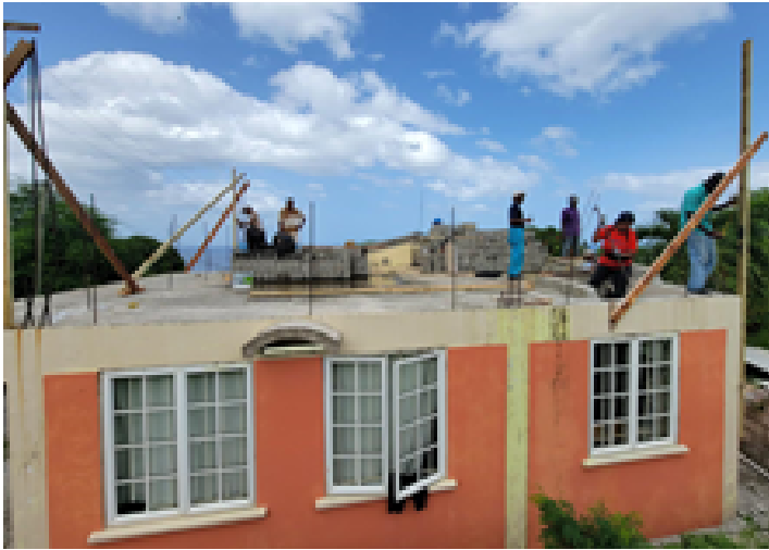
How it started