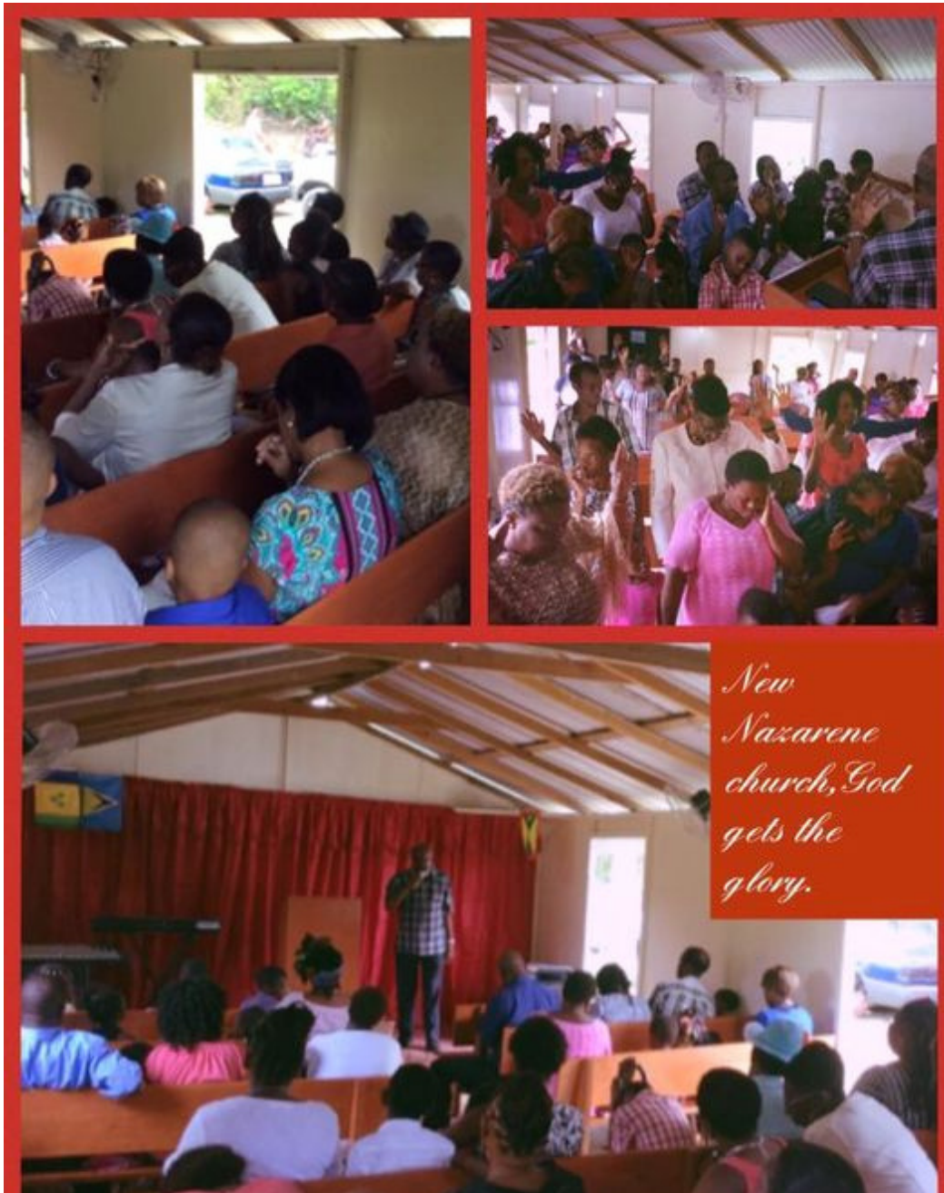
Content Church of the Nazarene