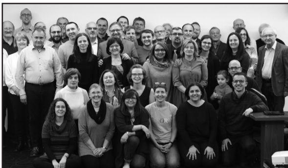
(EuNC's 2020 All-Faculty Assembly.)

Europe and the Commonwealth of Independent States (CIS). This is strategically important to fulfill the mission of the church.