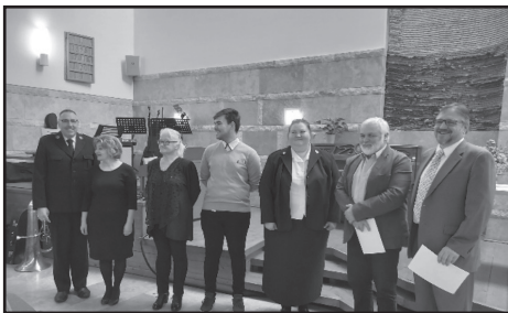
(Hungary Learning Center Graduation)

“Some of the best times at the Methodist facility where classes were held in Budapest were the times in-between the classes around the coffee table. There was always fresh pastry made by the staff members, and the students were also assigned to participate, serving one another. There were many hot discussions of the in-class topics and many stories and laughter shared from ministry-life, which stayed with them and are often re-told.”