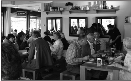
(Joint Work and Witness teams from Wichita, Kansas, USA, Netherlands, and Germany)

become. Investments have been significant, and they have provided a legacy upon which EuNC could build. If you are one of those who gave, or worked, or studied so that EuNC could thrive, thank you! Your World Evangelism Fund giving, Alabaster offerings, bequests, your prayers, and labors of love; your partnership in whatever form it took, has made EuNC what it is. And the circles of holy influence continue to expand. Thank you!