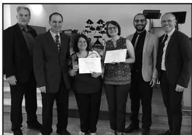
(Italy Learning Center Graduation)

New realities call for new approaches – but the content is the same: praising God for what has been happening in the past school year through European Nazarene College and celebrating the students for their accomplishments. What is significant and treasured now is that this can happen, in the different countries, with the Nazarenes of the districts being able to be part of these special times.