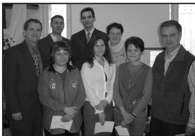
(Romania Learning Center Graduation)