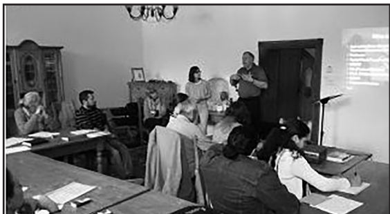
(Learning Center class in Romania)

Romania is a good example of the importance of the district's close relationship with the local churches and the college in the formation of students in becoming ministers. As can be clearly seen, these relationships need to be intentionally fostered. They must become part of the strategy for the future to bring the message of holiness to Romania.